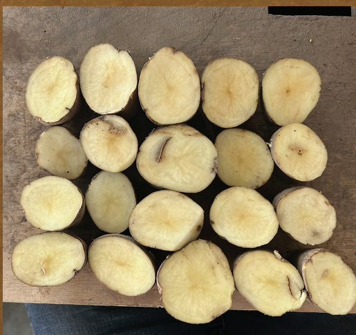
Trebuset® Seed Treatment (0.062 fl oz/100lb)

Contract research trial 51 days after inoculation USWG0T2122023; Rupert, ID, 2023.